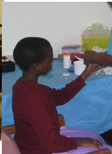
Beanie Babies help take the pain away...